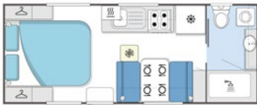
19' Tandem Axle 1900_C_K2E8_T Ensuite Van