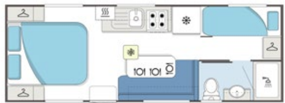
21'6 Tandem Axle 2160_C_K2E5B_T Double Bunk