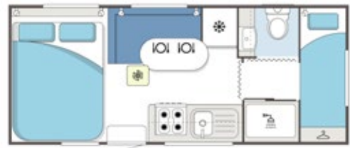
18' Single Axle 1800_C_K1E11B_S Bunk Van