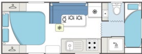
20'6 Tandem Axle 2060_C_K1E11B_T Ensuite Van