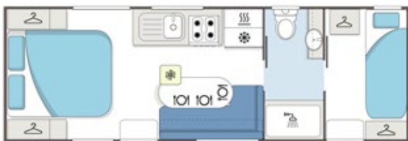
22'6 Tandem Axle 2260_CR_K2E6B_T Double Bunk