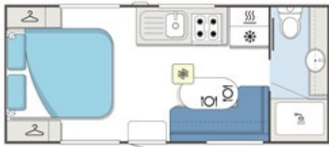
17'6 Single Axle 1760_C_K2E3_S Ensuite Van